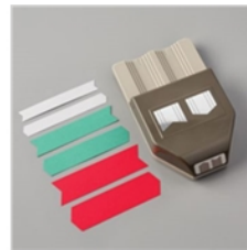
Banners Pick A Punch