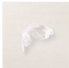
White 3/8" (1 Cm) Glittered Organdy Ribbon