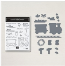
Santa's Delivery Bundle (English)