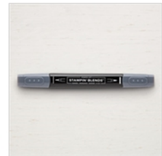
Basic Black Dark Stampin' Blends