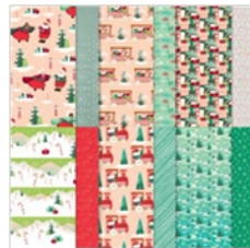
Santa Express 12" X 12" (30.5 X 30.5 Cm) Designer Series Paper