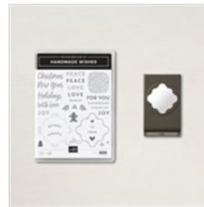
Handmade Wishes Bundle (English)