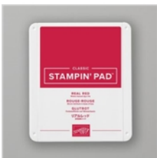
Real Red Classic Stampin' Pad